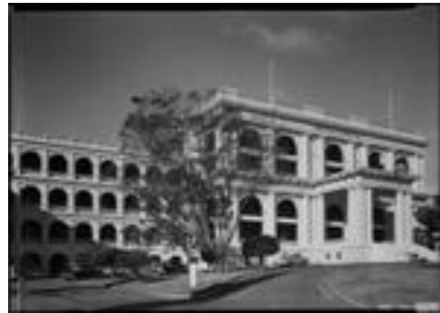
St John of God Hospital, Subiaco June 1955