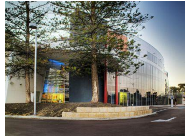
Bendat Comprehensive Cancer Centre